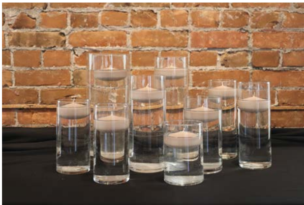
ASSORTED VASES + FLOATING CANDLES $4 PER PIECE