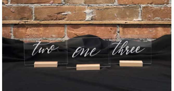
ACRYLIC TABLE NUMBERS $25 FOR 10 TABLES OR LESS $50 FOR 11 TABLES OR MORE