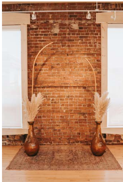
GOLDEN ARCHES $175 WITH PAMPAS VASES + AREA RUG