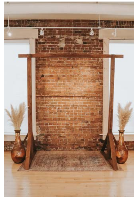
WOOD FRAME ARCHWAY $175 WITH PAMPAS VASES + AREA RUG