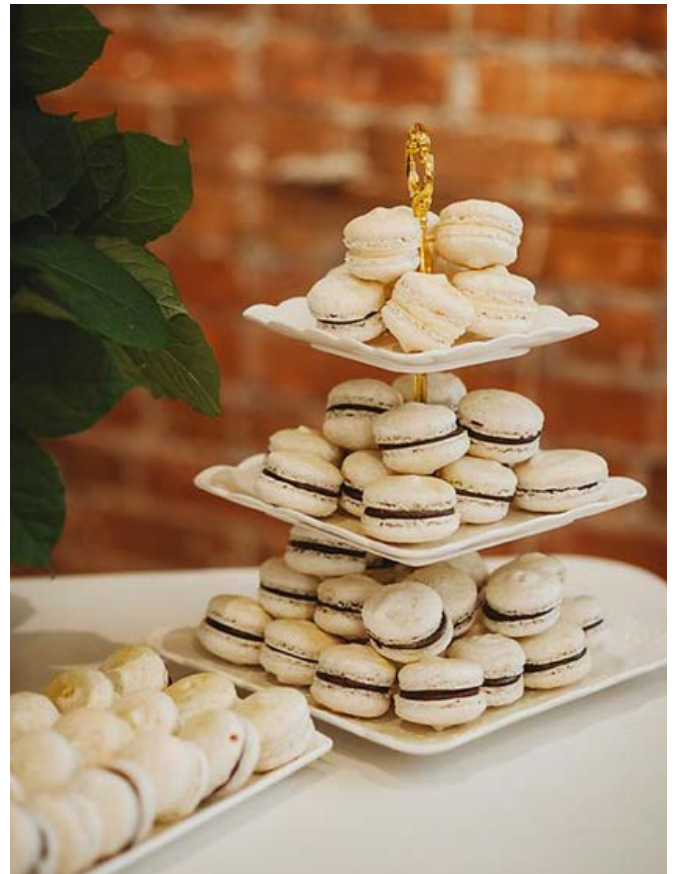
CUPCAKE/SWEETS STAND $10 EACH