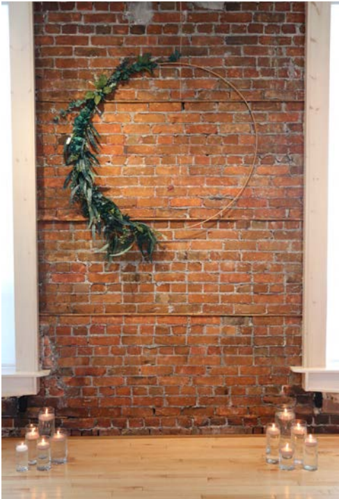
HOOP BACKDROP $95 INCLUDES GREENERY

Backdrops for Ceremonies, Head Tables or Photobooths!