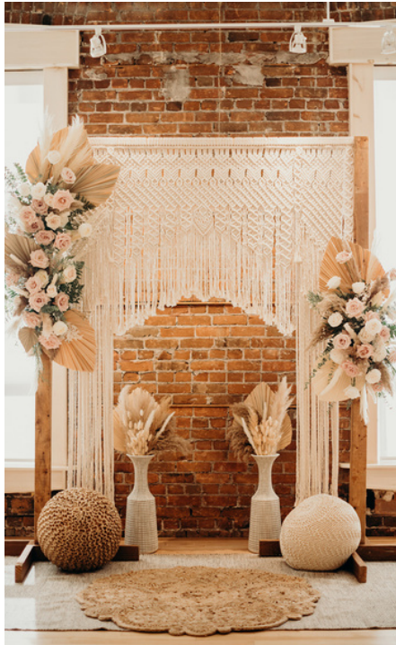
MACRAME BACKDROP $150 NOT INCLUDING FLORAL