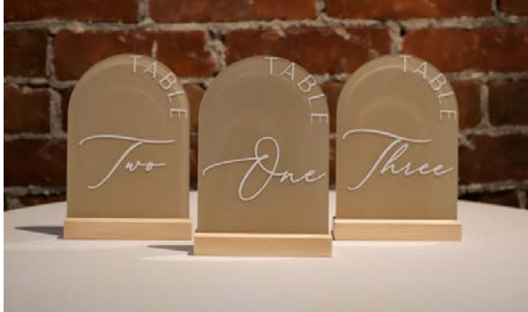
TAN TABLE NUMBERS $25 FOR 10 TABLES OR LESS $50 FOR 11 TABLES OR MORE