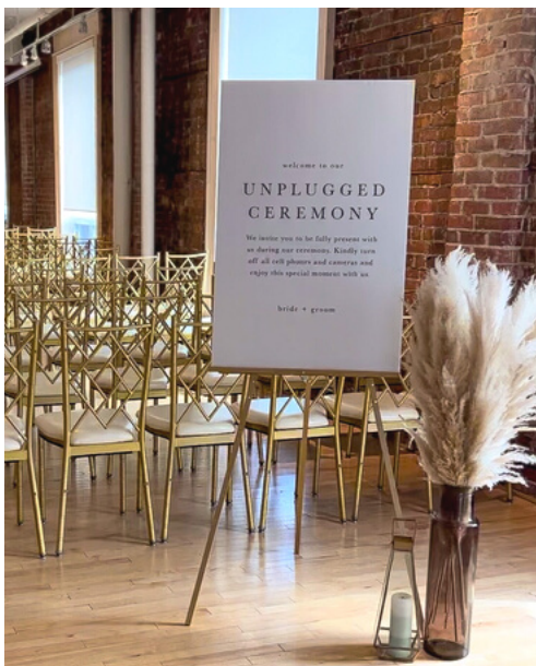
GOLD EASEL $20