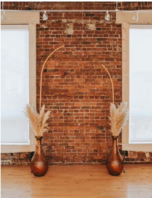
GOLDEN ARCHES $100 WITHOUT PAMPAS VASES $150 WITH PAMPAS VASES